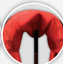
Soft Neoprene Material